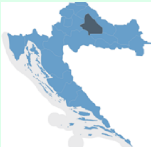
Position of Bjelovar-bilogora county

The city of Grubišno Polje belongs to Bjelovar-Bilogora county and its area is the largest local government unit. The city covers an area of 269 km 2 , of which forests cover 12.000 ha (45%-oak, beech and hornbeam).